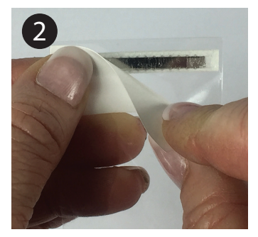
REMOVE backing behind the security label. The glue is low tack like a post-it note.