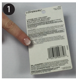
Find a place on the BACK of the card DO NOT COVER key art, selling points or ingredients.