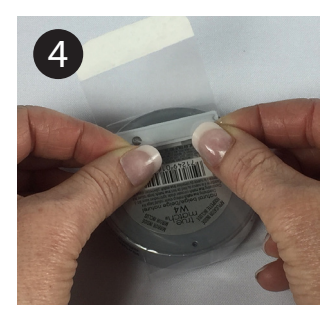
WRAP around product and over the security tag, so it is smooth and tight.