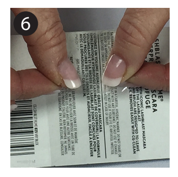
PRESS the glued end onto the wrap.