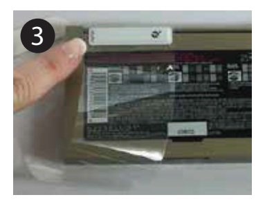
PLACE the tag on the BACK of the case so the wrap covers the back. The low tack glue allows you to reposition.