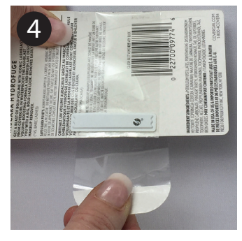
WRAP around product and over the security tag, so it is smooth and tight.