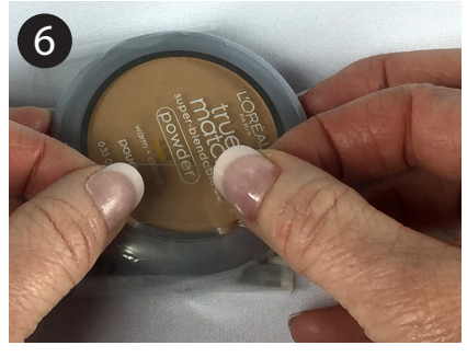
PRESS the glued end onto the wrap.