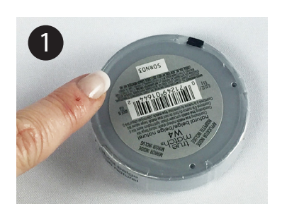
Find a PLACE on the BACK of the compact. DO NOT COVER key art, selling points or ingredients.