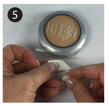
REMOVE backing on the END of wrap