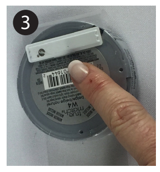
PLACE the tag on the BACK of the compact so the wrap covers the back. The low tack glue allows you to reposition.