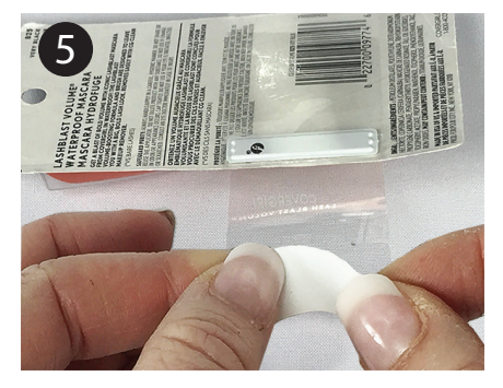
REMOVE backing on the END of wrap