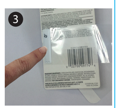
PLACE the tag on the EDGE of the card so the wrap covers the back. The low tack glue allows you to reposition.