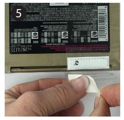
REMOVE backing on the END of wrap