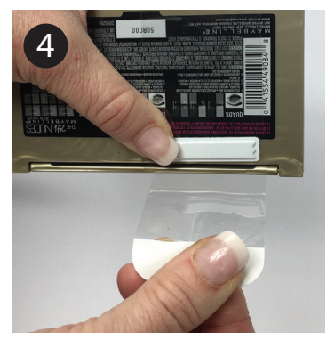
WRAP around product and over the security tag, so it is smooth and tight.